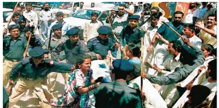
Pakistani police clubbing peaceful demonstrators.

Sindhis are suffering from a military dictatorship bent on using their resources to promote a militant Islamist agenda—for example, by developing nuclear weapons and exporting them to other Muslim countries, and by facilitating the training of terrorists in madrasahs. The repressive nature of the Pakistani regime, and its powerful ethnic base in a fanatic fundamentalist population, make it nearly impossible for Sindhis to engage in a civic dialog within Pakistan.