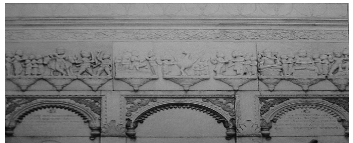
Carving at Saadha Belo Island Temple, Sindh. One of holiest Hindu Sindhi shrine, it was vandalized by the Pakistani army in 1965.

The law and practices discriminate against minorities in other ways. In civil and criminal trials, the testimony of a witness belonging to a religious minority is deemed inherently untrustworthy. A non-Muslim man may not marry a Muslim woman. By law, members of the religious minorities cannot hold executive positions such as Mayor, Governor or President.