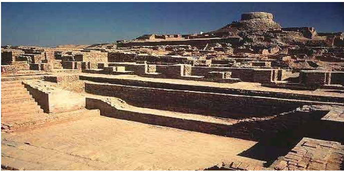
Moenjodaro: View from ritual bathing pool

Sindh is an ancient country whose civilization stretches back to the earliest human settlements. The ancient Sindhi people embraced a peaceful way of life. Moenjodaro, a city that flourished in 2600 B.C., shows advanced city planning and well-developed arts, yet an absence of even basic military fortifications and weapons. 1 Based on accounts of scholars who accompanied Alexander during his invasion of Sindh, the Roman philosopher Strabo described the Sindhi belief that God the Supreme Creator incites no war. Sindh was invaded by the Arabs in 712 A.D., a brutal conquest that was followed by the massacre of 6,000 Prisoners of War and the transportation of 30,000 young men and women sent into slavery. Thirty-six years later, an insurrection restored the independence of Sindh.