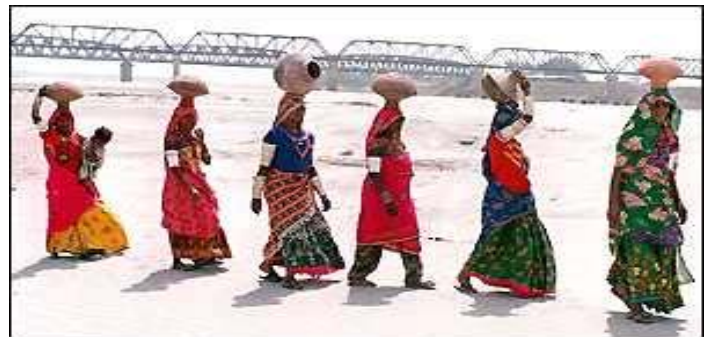
Searching for water in the riverbed of the once mighty Indus.

Water no longer flows to the sea; as a consequence, the mangrove forests have experienced a 90% decline—from 2400 square kilometers to 200 square kilometers. Without protection from the mangrove forests, seawater has encroached—inundating 1.2 million acres of agricultural land and uprooting residents of 159 villages. The once plentiful seafood catch has been drastically reduced. The net result is that throughout Sindh, poverty levels, malnutrition and disease now match those in Sub-Saharan Africa.