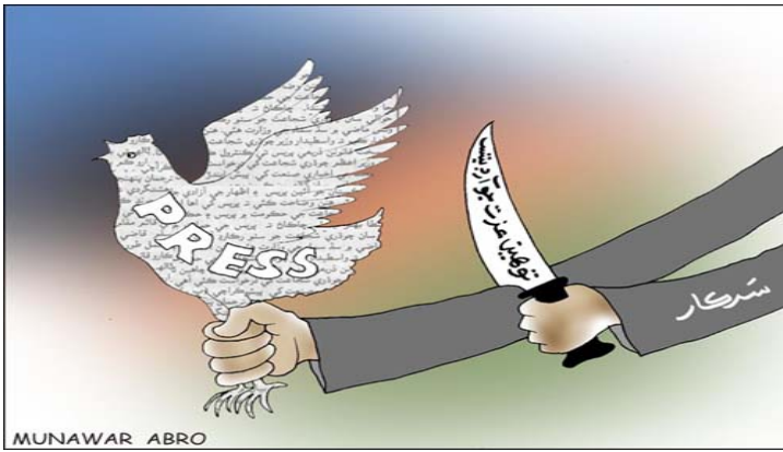
Press under a butcher's knife. The sleeve reads 'Government' (Cartoon in Sindh Daily Kawish).

Pakistan has frequently banned Sindhi books, newspapers and magazines. In 1975, the largest circulation women's magazine Sojhiro (Daylight) was banned. In 1999, the largest circulation Sindhi monthly magazine Subhu Thiindo ('A New Day will Dawn') was banned for spreading disaffection against the 'Islamic ideology of Pakistan.' The magazine focused on sustainable development and environmental protection. The government often uses violence and intimidation against journalists. For example, in August 2003, six Sindhi journalists covering a peaceful protest during the Pakistani dictator General Musharraf's visit to a college were arrested under 'anti-terrorism' laws. In the past two years, two journalists have been killed for covering corruption and the government has failed to aggressively pursue the crimes.