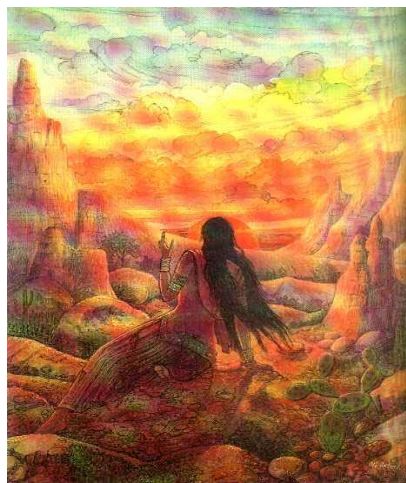
In a famous Sindhi folk-tale immortalized by the 17 th century Sindhi poet Shah Latif, Sasui crosses an inhospitable desert and formidable mountain peaks in search of her kidnapped lover.

In traditional Sindhi culture and folklore, women are celebrated for their independent and adventurous spirit. Many Sindhi folktales are legends about heroines who defied family or social custom to choose their own marriage partners. 7