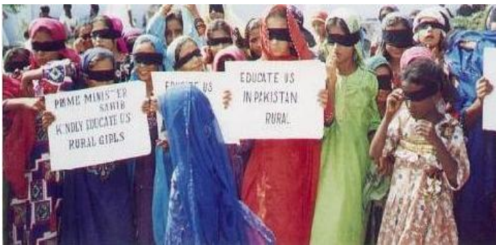
Primary school girls in Sindh village wear blindfolds as a protest against lack of secondary schools. A placard reads, "Educate Us Pakistan."

A majority of Sindhi girls and almost half of Sindhi boys do not receive even basic schooling and remain illiterate. Yet Pakistan continues to allocate a majority of its available budgetary resources to its military. For example, Pakistan's 2003-04 federal budget allocated Rs 3.1 billion (about US $52 million) for education while allocating Rs 161 billion (about US $2.7 billion) for the military. The actual military expenditure is substantially higher—for example, the pensions of retired military personnel are not included in the military's budget. The 2004-05 provincial budget of Sindh, also dictated by the federal government, allocated Rs 2.6 billion ($43 million) for education while allocating Rs 10.1 billion ($168 million) for 'law and order.'